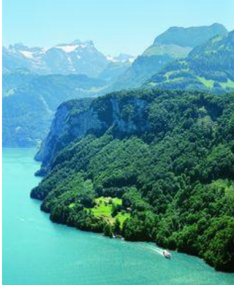
The Rütli by Lake Lucerne in the canton of Uri

The Rütli meadow has become a symbol of Swiss national legend, with myth playing a decisive role. The site continues to hold great appeal to the present day, although that harbours a risk of misuse and overexploitation.